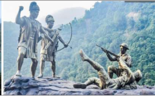
Anglo-Abor War memorial

The Upper Siang Hydroelectric Project or Siang Upper Multipurpose Project (SUMP) is the biggest hydroelectric power project planned in Upper Siang district, whose planning was commenced by the NHPC in April 2009 to build various hydro dams in phases over a span of 15-20