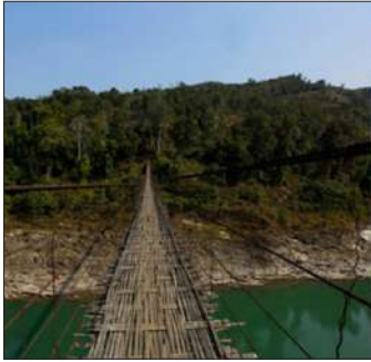
Mighty Siang River